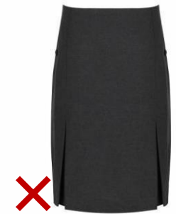
short pleat on a pencil style

(full length pleat or with dropped waist)