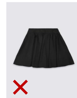
short skater style